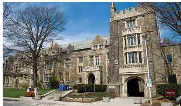
PAHO/WHOCC Collaborating Center in Primary Care Nursing and Health Human Resources- McMaster University- Hamilton Canada