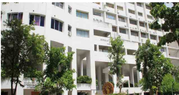
PAHO / WHOCC for Nursing and Midwifery Development - Chiang Mai University – Chiang Mai, Thailand