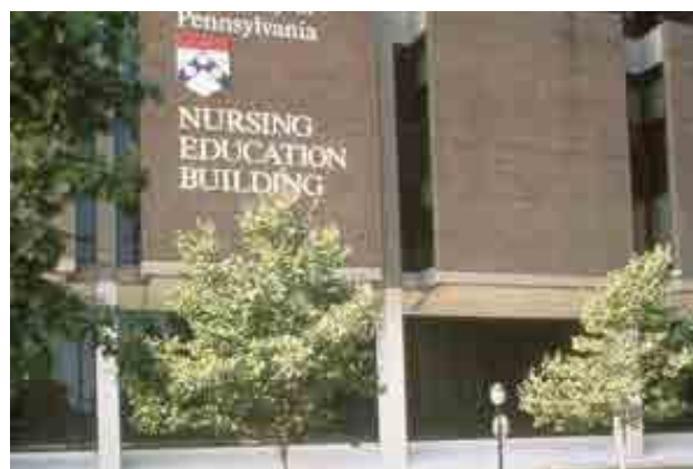
PAHO/ WHOCC Collaborating Centre for Nursing and Nursing Development In Primary Health Midwifery Leadership- University of Pennsylvania- Philadelphia, USA