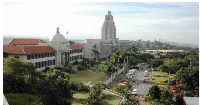
PAHO/WHOCC for Educating Nurses and Midwives in Community Problem Solving - University of Natal-Durban, South Africa