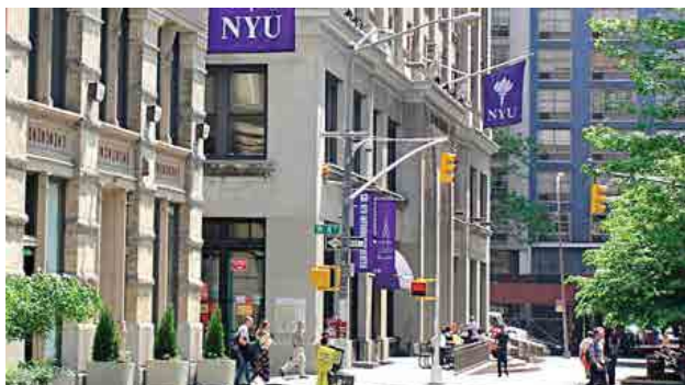
PAHO/WHOCC Collaborating Centre in Gerontological Nursing Education New York, New York, USA