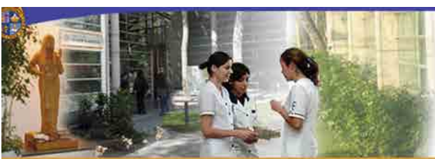
PAHO/WHOCC Collaborating Centre for Health Services and Nursing Development for Noncommunicable Disease Care- Pontificia Universidad Catolica de Chile Santiago, Chile