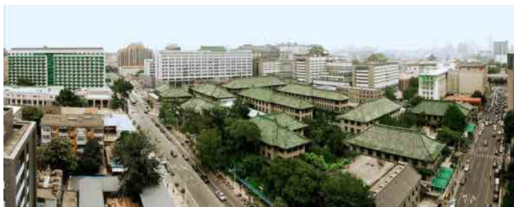
PAHO/WHOCC Collaborating Centre for Nursing Policy-Making and Quality Management – Peking Union Medical College – Beijing China