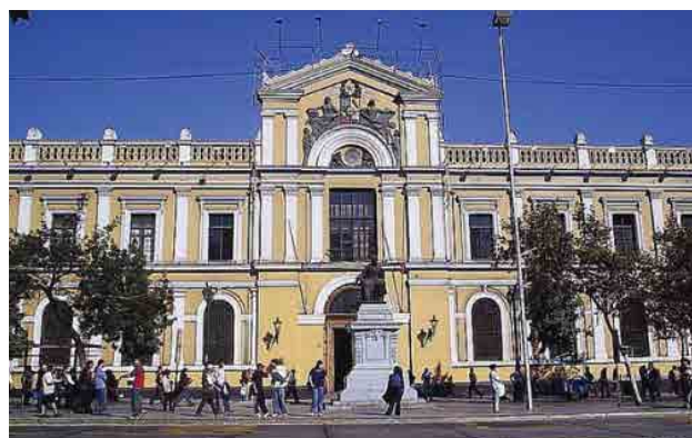
PAHO/WHOCC Collaborating Center for Development of Midwifery- University of Chile – Santiago, Chile