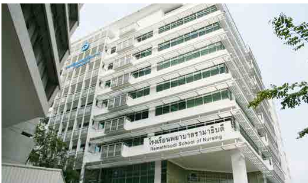
PAHO / WHOCC for Nursing and Midwifery Development – Ramathibodi School of Nursing – Mahidol University, Bangkok, Thailand