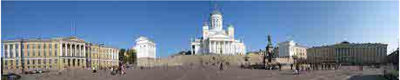
PAHO/WHOCC WHO Collaborating Centre for Nursing Research Foundation Helsinki, Finland