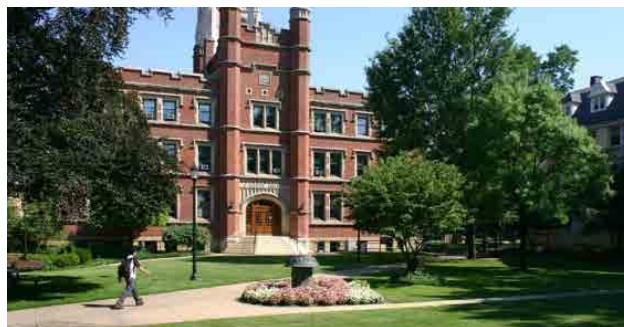
PAHO/WHOCC for Research & Clinical Training in Home Care Nursing – Case Western Reserve University – Cleveland, USA