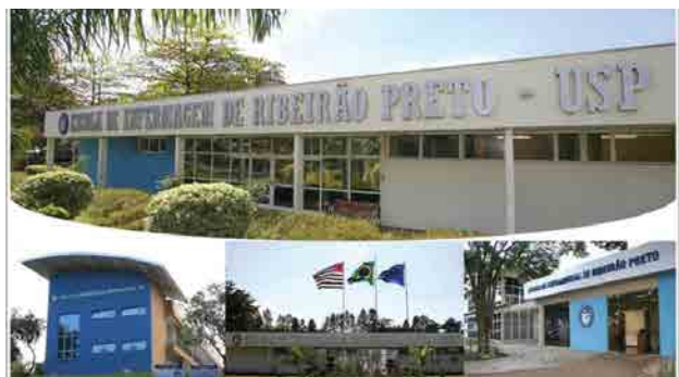
PAHO/WHOCC Collaborating Centre for Nursing Research Development- University of São Paulo - Ribeirão Preto, Brazil