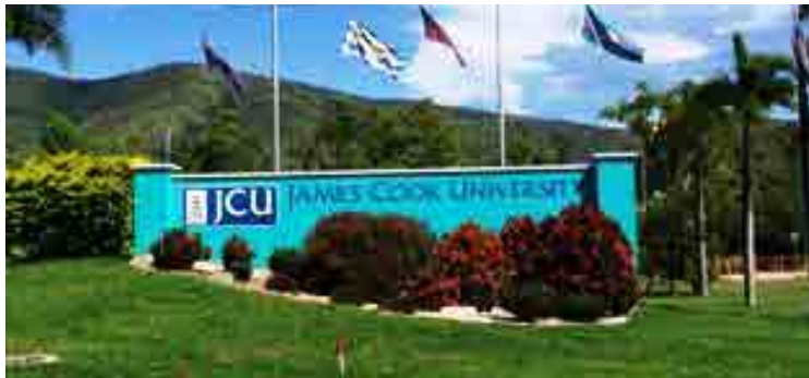
PAHO/WHOCC Collaborating Center For Nursing and Midwifery Education and Research Capacity Building - James Cook University Australia, Cairns, Australia