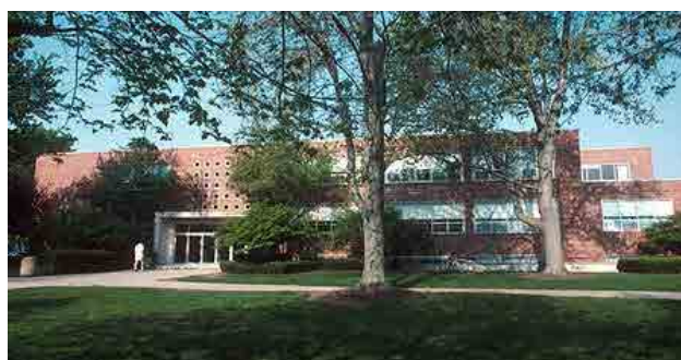
PAHO/WHOCC for Research and Clinical Training in Health Promoting Nursing – University of Michigan – Ann Arbor USA