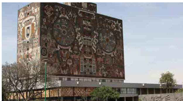
PAHO/WHOCC Collaborating Centre for the Development of Professional Nursing – Universidad Nacional Autónoma de México - México DF, México