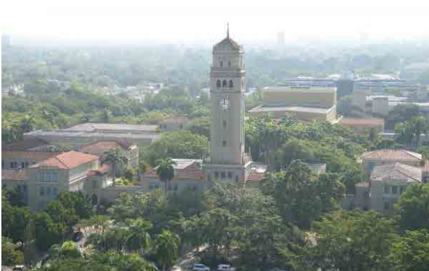
PAHO/WHOCC Collaborating Centre for Development of Midwifery Services and Education University of Puerto Rico- San Juan, Puerto Rico