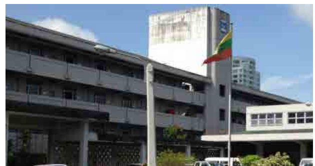
PAHO/WHOCC for Nursing and Midwifery development University of Nursing – Yangon, Myanmar