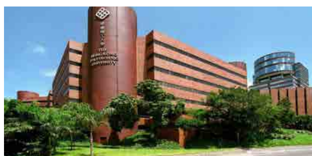
PAHO/WHOCC For Community Health Service - The Hong Kong Polytechnic University (HKPU) Hong Kong - China