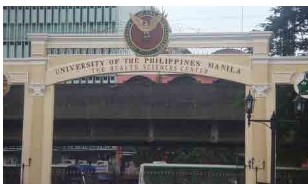
PAHO/WHOCC Collaborating Centre for Leadership in Nursing Development – University of the Philippines Manila – Metro Manila, Philippines