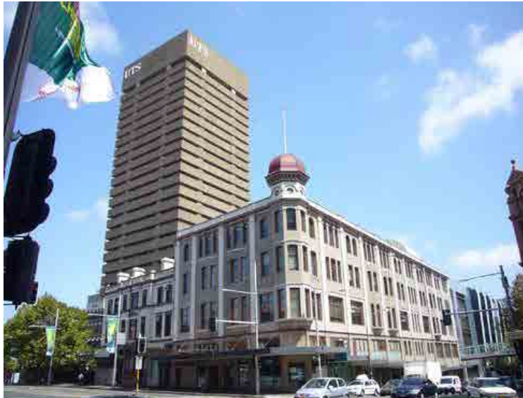
PAHO/WHOCC Collaborating Centre for Nursing, Midwifery and Health Development - University of Technology, (UTS) – Sidney, Australia