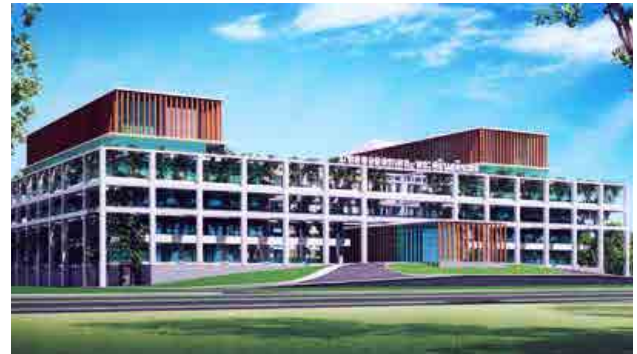
PAHO / WHOCC for Nursing and Midwifery Development Faculty of Nursing – Mahidol University, Bangkok, Thailand