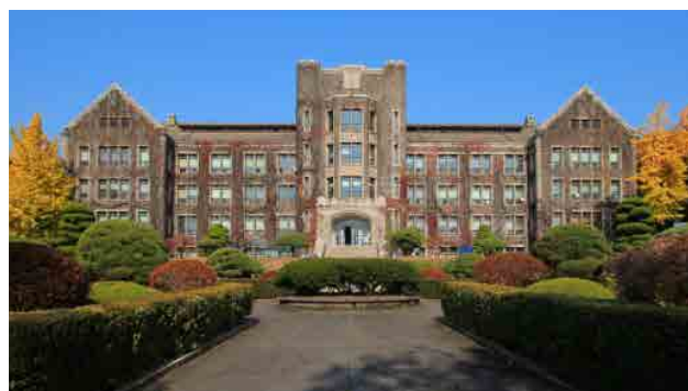
PAHO/WHOCC Collaborating Centre for Research and Training for The Catholic University of Korea University – Seoul, Korea