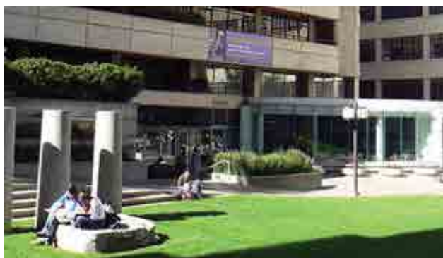
PAHO/WHOCC Collaborating Centre for Research & Clinical Training in Nursing University of California- San Francisco, USA