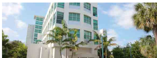
PAHO/WHOCC Collaborating Center for Nursing Human Resources Development and Patient Safety - University of Miami – Miami, USA