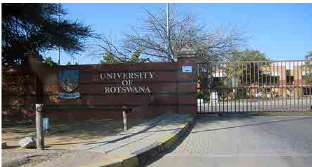
PAHO/WHOCC for Nursing and Midwifery Development University of Botswana – Gaborone District, Botswana