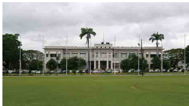
PAHO/WHOCC Collaborating Center for Nursing and Midwifery Development in the Caribbean- University of the West Indies Kingston, Jamaica