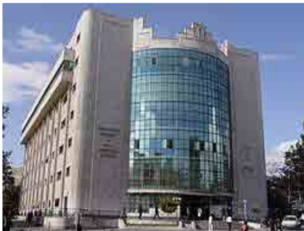
PAHO/WHOCC Collaborating Center for Education and Research in Nursing and Midwifery Iran University of Medical Sciences – Tehran, Iran