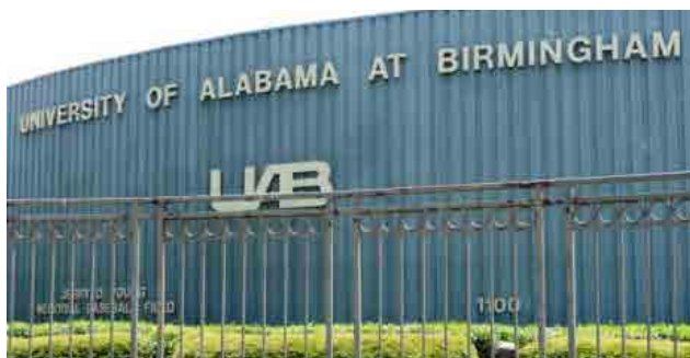
PAHO/WHOCC for International Nursing Resources- University of Alabama at Birmingham – Birmingham, USA