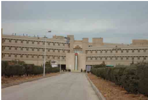
PAHO/WHOCC Collaborating Centre for Nursing Development Jordan University of Sciences and Technology – Irbid, Jordan