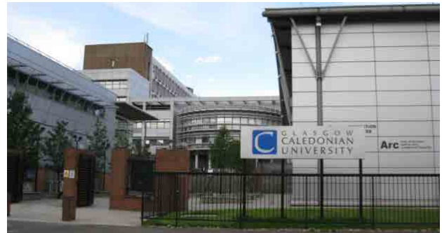
PAHO/WHOCC Collaborating Centre for Nursing and midwifery Education, Research and Practice – Glasgow Caledonian University – Glasgow, Scotland