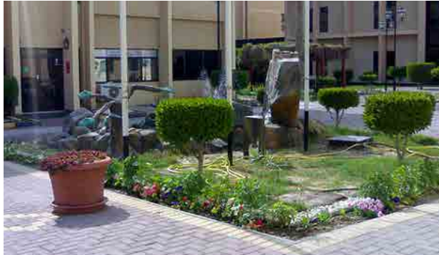
PAHO/WHOCC Collaborating Centre for Nursing Development College of Health Sciences, Ministry of Health – Manama, Bahrain