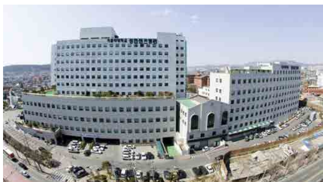
PAHO/WHOCC On nursing and Health Innovation - Nursing Development in Primary Health Care - Yo College of Nursing Seoul, Korea