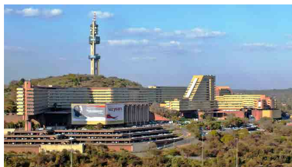
PAHO/WHOCC for Postgraduate Distance Education and Research in Nursing and Midwifery Development University of South Africa- Pretoria, South Africa