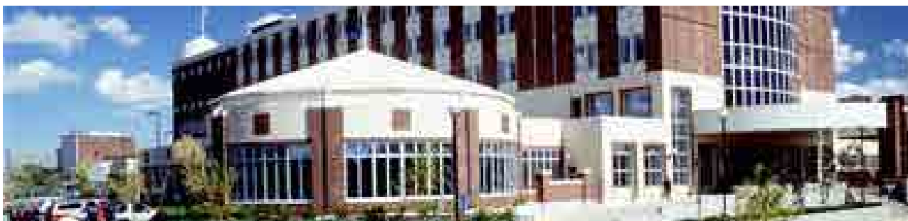
PAHO/WHOCC Collaborating Centre for Nursing and Mental Health – University of Alberta, Edmonton, Canada