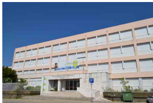
PAHO/WHOCC Collaborating center for nursing practice and research nursing school of Coimbra Coimbra, Portugal