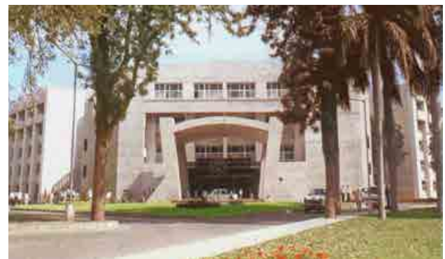
PAHO / WHOCC for Nursing and Midwifery Development – Post Graduate Institute of Medical Education and Research (PGIMER) – Chandigarh, India