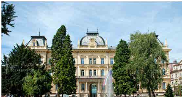
PAHO/WHOCC Collaborating Centre for Primary Health Care Nursing - Nursing Health Centre Health Centre Dr Adolfa Drolca Maribor, Slovenia