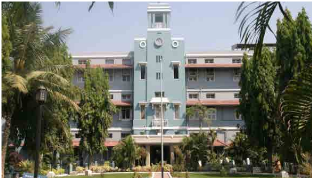
PAHO/ WHOCC for Nursing and Midwifery Development – Christian Medical College and Hospital - Vellore, India