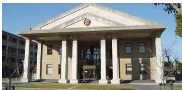
PAHO/WHOCC Collaborating Centre for Nursing in Disasters and Health Emergency University of Hyogo – Akashi Japan