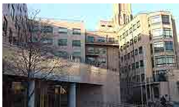
PAHO/WHOCC Collaborating Centre for Nursing Development in Primary /Health Care – St Luke's College of Nursing – Tokyo Japan